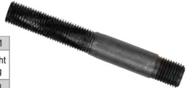
TYPE: T2-CS IS: 13178 - 1991